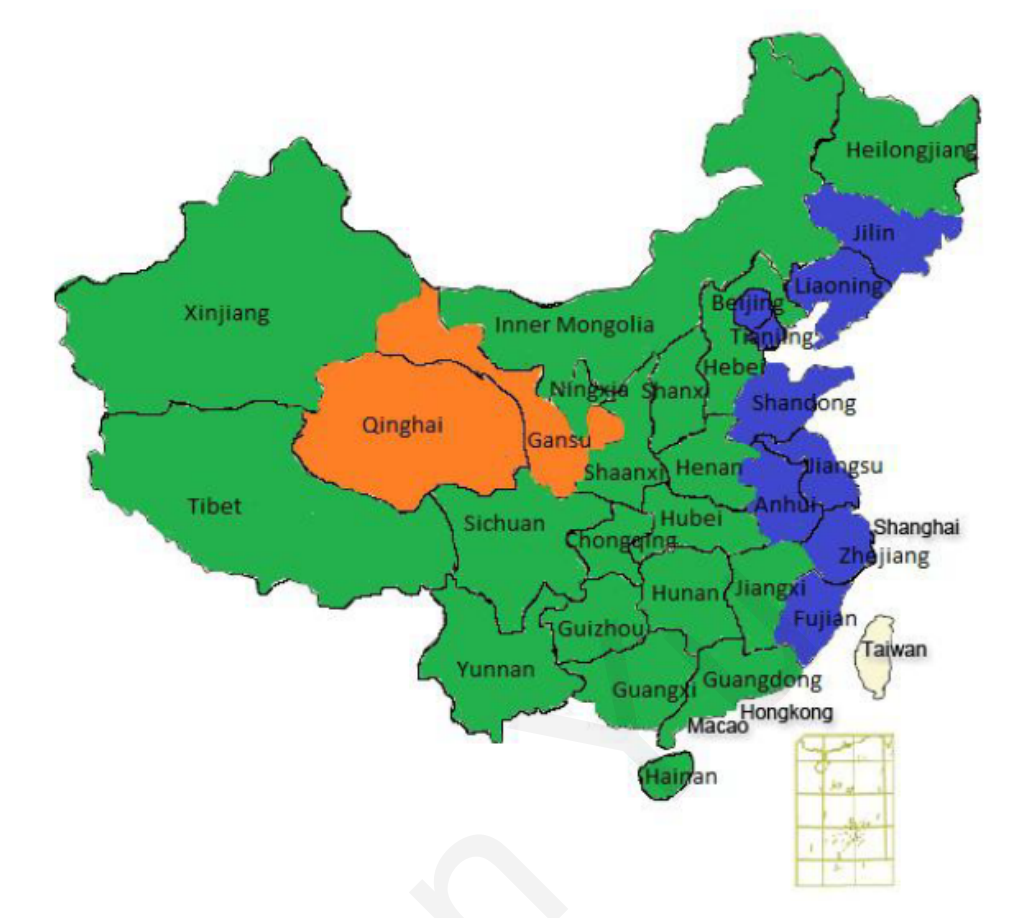
Figure 1: Rate of Returns of Chinese Regions