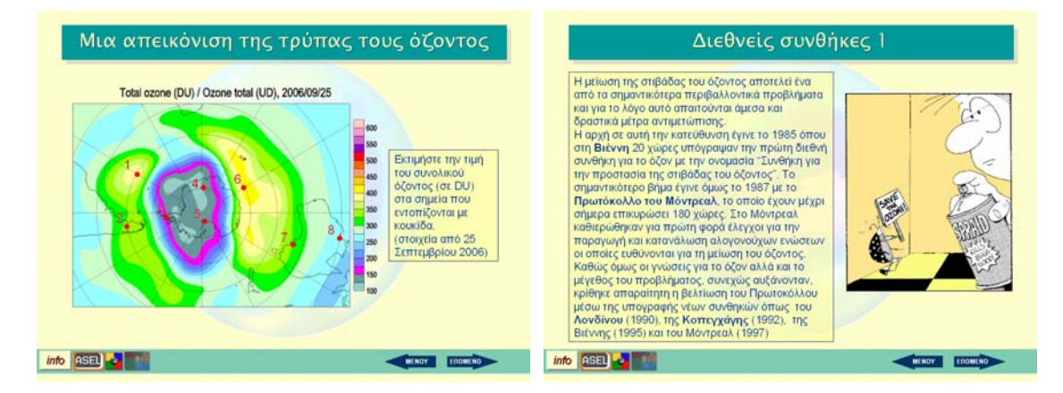
Figure 1. Two screenshots from the software

Student's navigation through the software was made with the help of an instrument which include guidelines, questions and specific activities for the students.