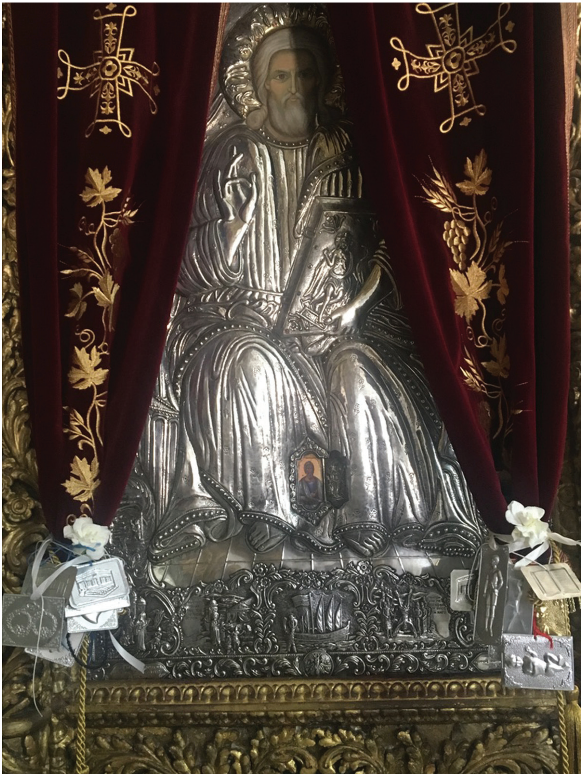
Figure 3.2: Apostolos Andreas icon inside the church with pilgrims' tamata (votive offerings)