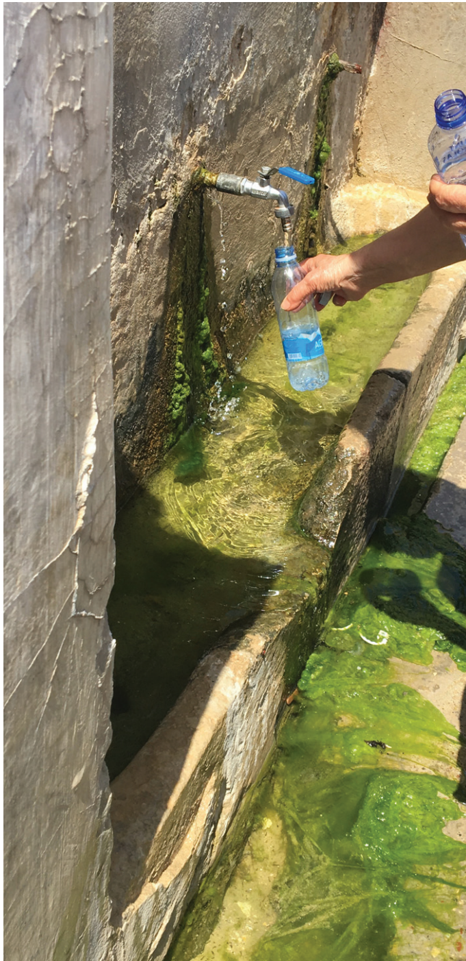
Figure 3.3: Taking water from the ayiasma (holy spring)