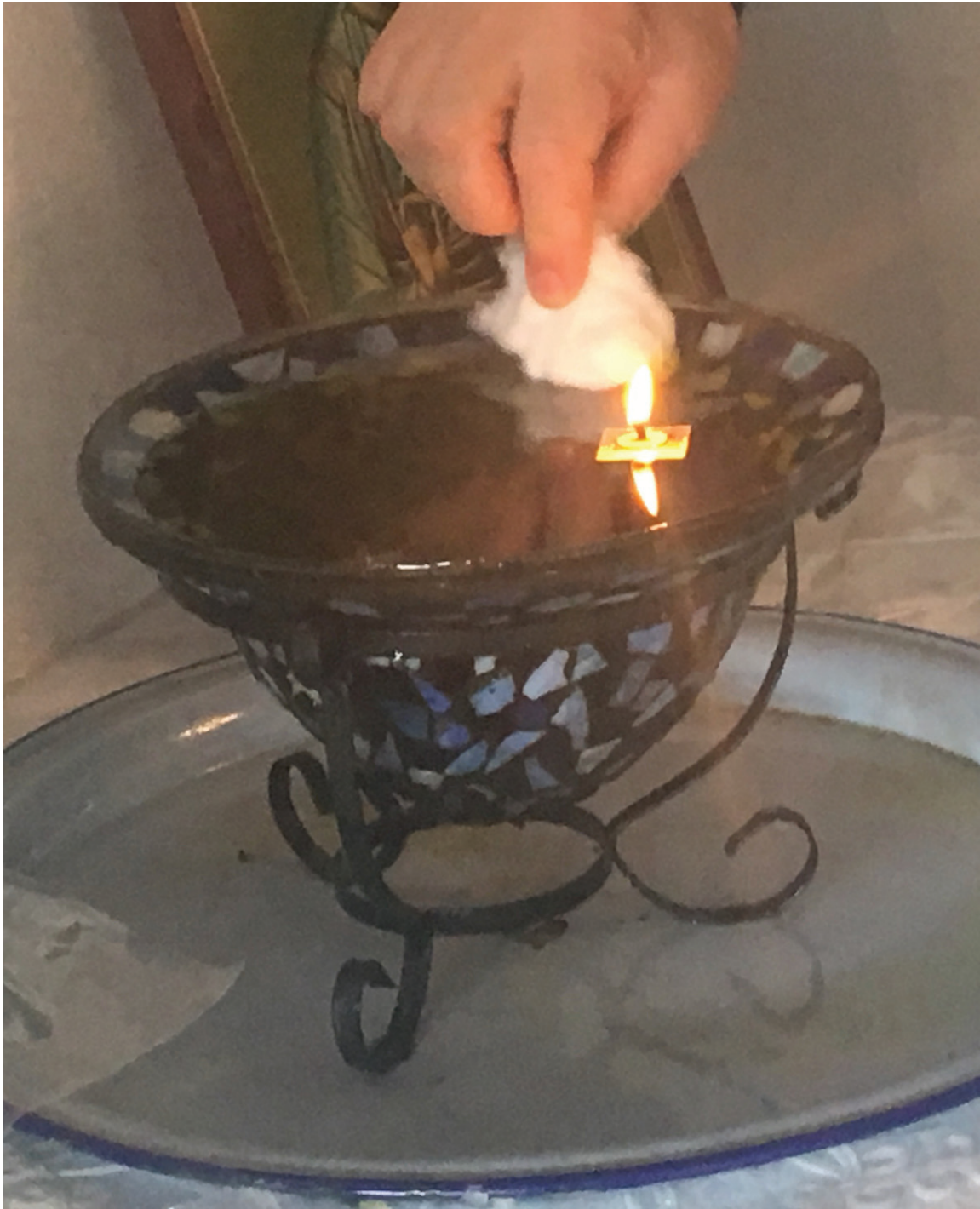
Figure 3.1: Taking oil