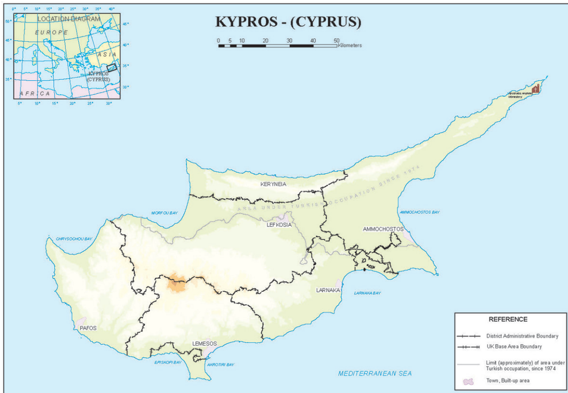
Figure 1: Cyprus Map with AA Monastery and Dividing Line (The map is prepared by the Department of Lands and Surveys with the sanction of the Government of Cyprus. State copyright reserved)