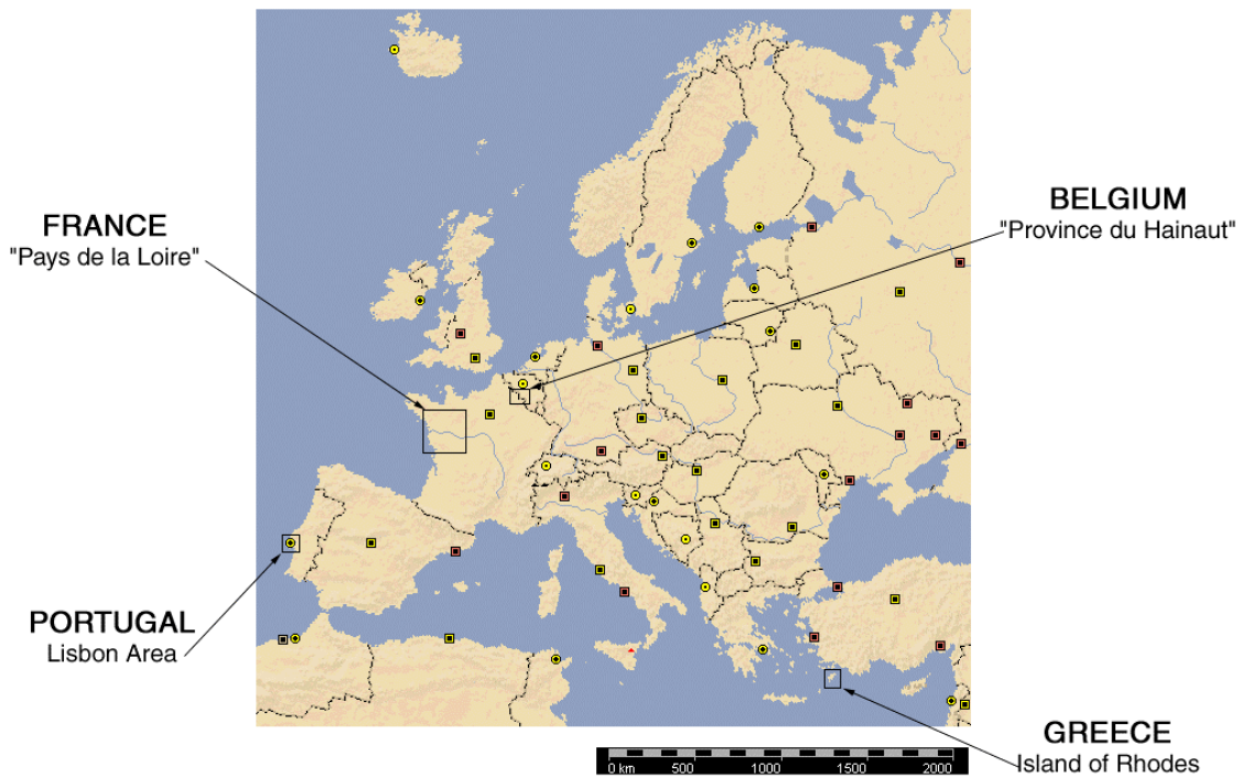
Figure 1. Location of the four national networks of schools involved in the ModellingSpace project