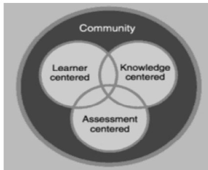
Figure 1. Components of Effective Learning Environment Framework (Samantha et al., 2004)

for feedback and revision. Moreover, what is assessed should be congruent with the learning objectives. Helping students to become metacognitive is one of the central tenets of the assessment-centered aspect of effective learning environments. Students should learn to articulate their thoughts and to compare and contrast them to those of other people, and also to provide justifications as why they accept one point of view rather than another. Self-assessment nurtures discovery, teamwork, communication, and conceptual connections (NRC, 2000).